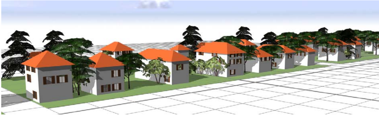
Fig. 2: 3D visualization of urban patterns with the CityEngine system

Then, stakeholders analyze the resulting urban patterns in participative workshops and evaluate the alternative scenarios of urban development both by subjective visual assessment and by objective indicator values such as noise reduction, rainwater drainage or recreation quality.